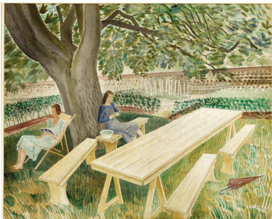
Two Women in a Garden Eric Ravilious